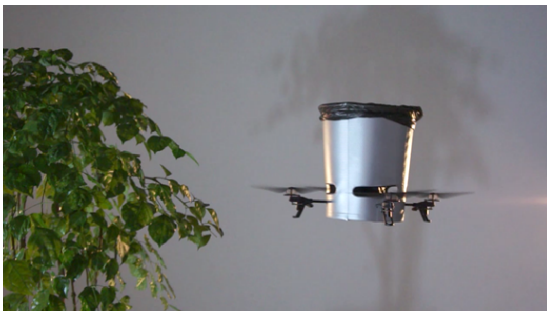
Floating Room , Samuel Adam Swope, 2016, screen shot, courtesy of the artist.

Viewers entering the exhibition space will first encounter an array of hovering hyper-physical objects within Samuel Adam Swope's staged house: Floating Room . Conceived as a sensorial, sculptural installation, Floating Room shapes interfaces between our things, flight, and air, and between fantasy and digital realization, transforming the domestic space from static and quiet dust-collecting rooms into sensational buzzing, windy soundscapes. From taking off, to hovering or drifting, and then landing, these floating technological-domestic hybrids touch other home interior artifacts through air currents or impact, embodying a message that mixes humor and narration into contemporary inquiries regarding emerging flight technologies, novel approaches to product delivery, and future smart homes.